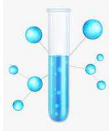
UNREGULATED CONTAMINANTS -DATES TESTED